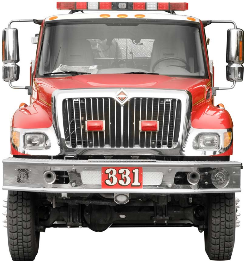
Apparatus Inventory Type 3 Engine