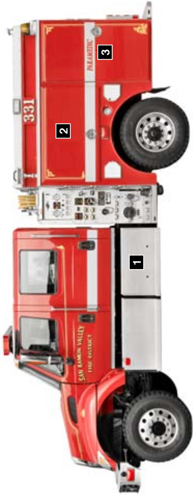
Type 3 Engine