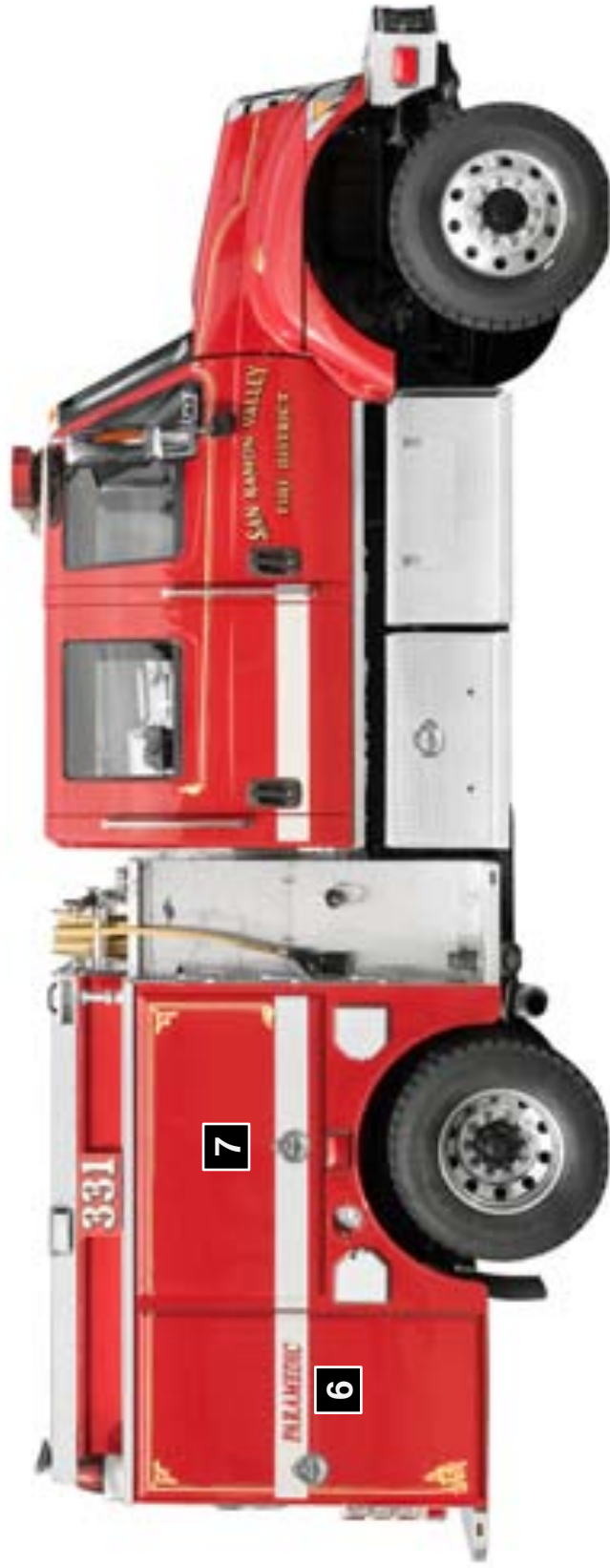
Type 3 Engine